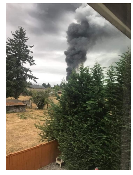
View of Puyallup cold storage fire from Thompson's house.

PUYALLUP, WA – On August 21, a Puyallup family was forced to evacuate their home due to the cold storage fire in Puyallup with their pregnant foster cat.