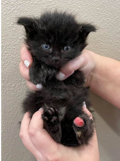
Echo missing back-left paw.

TACOMA, WA – On Dec. 7, Tacoma Animal Control brought two kittens with cut off limbs to the Humane Society for Tacoma & Pierce County.