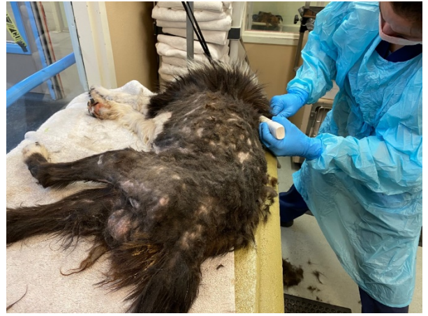
One of the matted dogs being shaved and cleaned by shelter staff.

nation, the Humane Society for Tacoma & Pierce County, cares for around 10,000 animals every year and maintains multiple humane programs. Dedicated to "Making Happy Happen," the