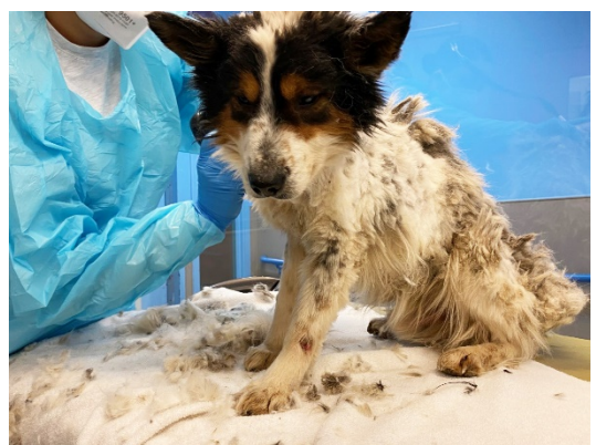
One of the matted dogs being shaved and cleaned by shelter staff.

A total of 19 dogs from different properties were brought to the Humane Society for Tacoma & Pierce County in terrible condition.