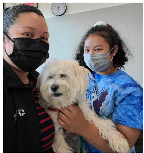
Picture 2 - Frosty reunited with his family at the Salem police station.

One of the oldest animal welfare organizations in the nation, the