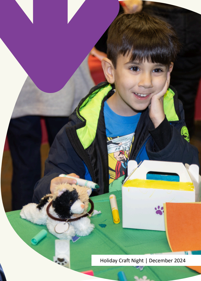
Holiday Craft Night | December 2024