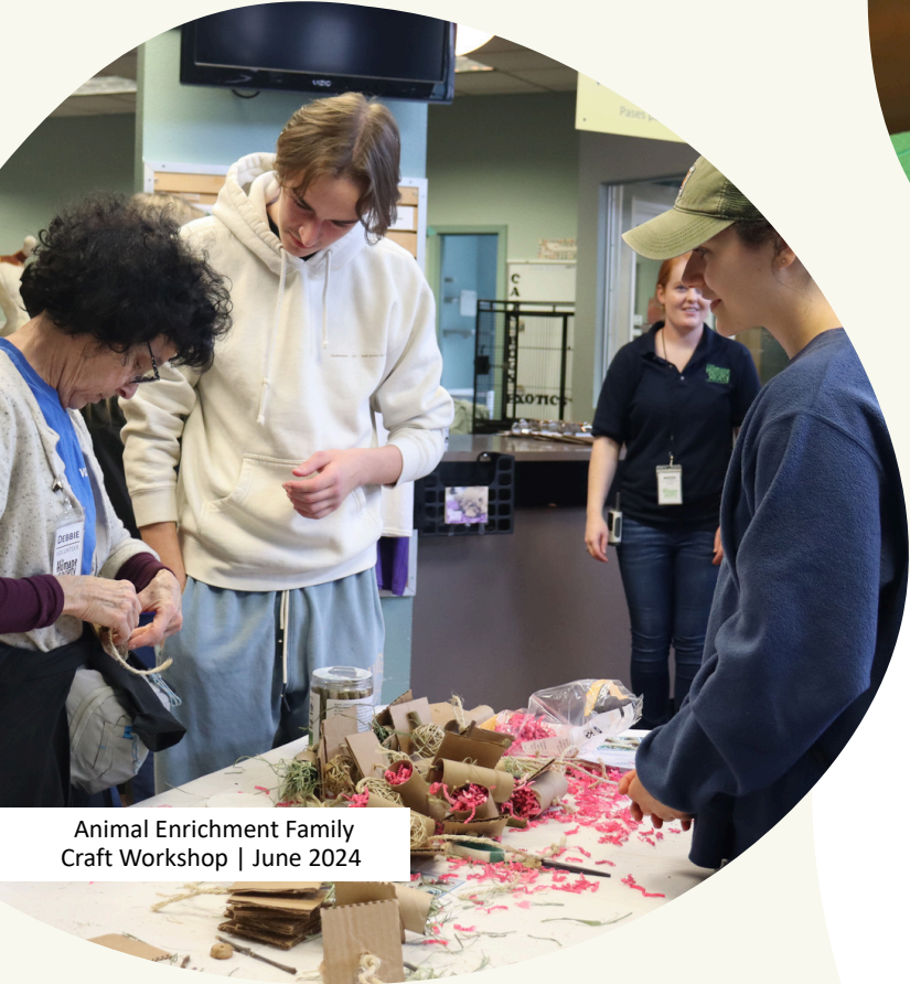
Animal Enrichment Family Craft Workshop | June 2024