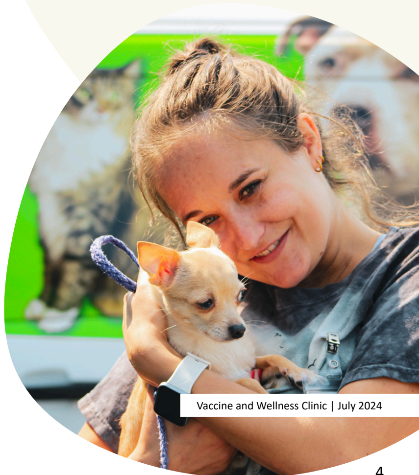
Vaccine and Wellness Clinic | July 2024

9,334 PETS SERVED THROUGH PET FOOD & SUPPLY PANTRY