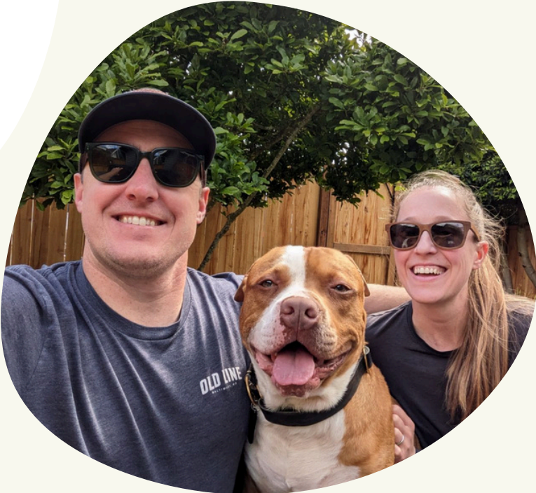
Quincey | Adopted May 2024

(following humane trapping, sterilization, and vaccination)