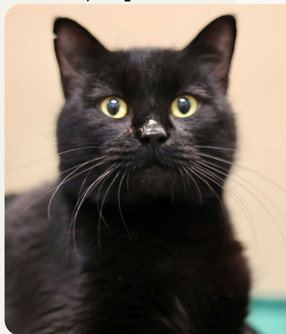
Tsunami, adopted Feb 2023