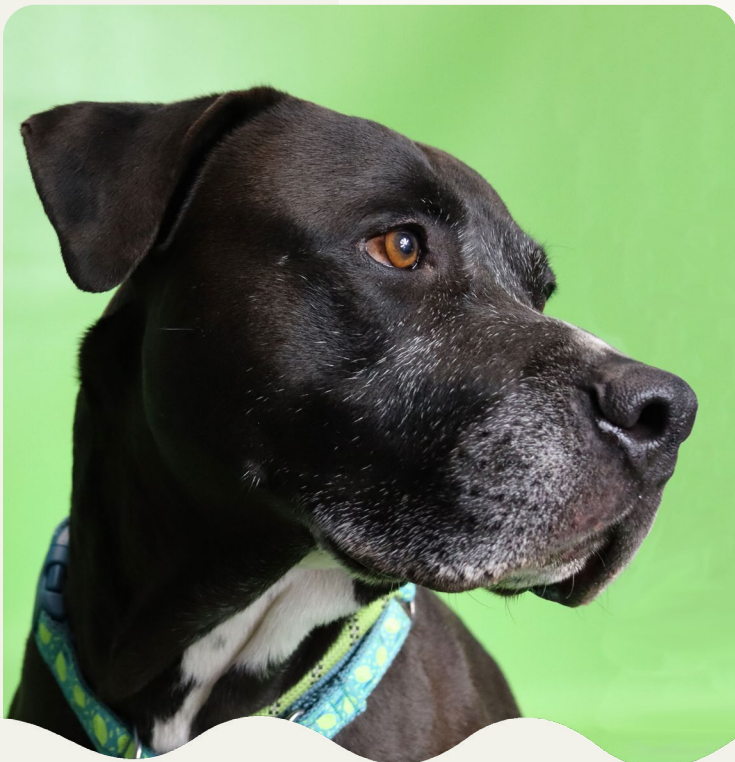
Grim, adopted June 2023