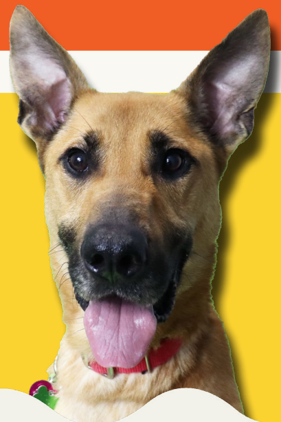
Horton, adopted June 2023

Live Release Rate is calculated by (total live outcomes) divided by (total outcomes minus owner requested euthanasia).