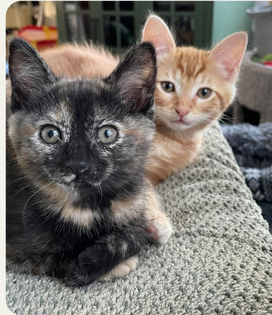
Pollie, adopted Oct 2023