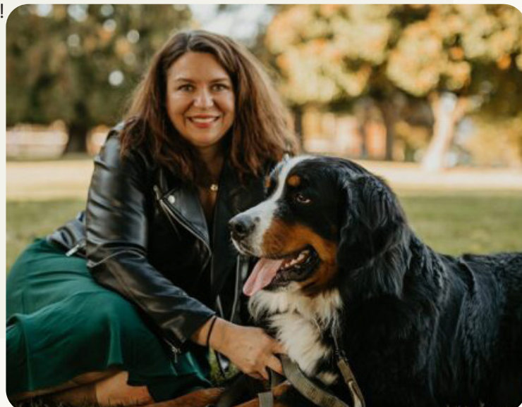
Chief Executive Officer